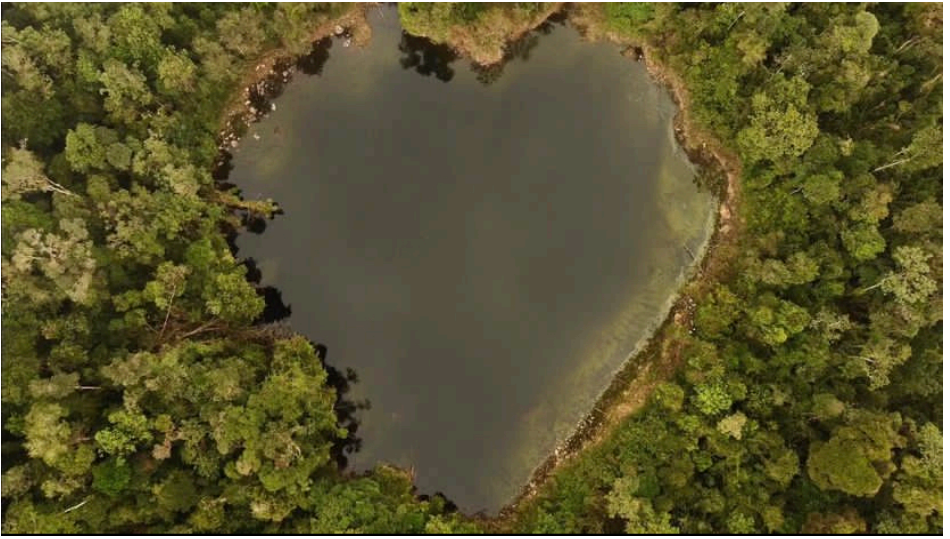
Playa Linda Lagoon, Miraflores