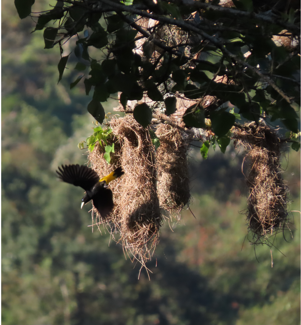
Cacicus cela | Yellow-dumped Cacique

How many things are related to the existence of a single bird? Discover the idea of the keystone species!