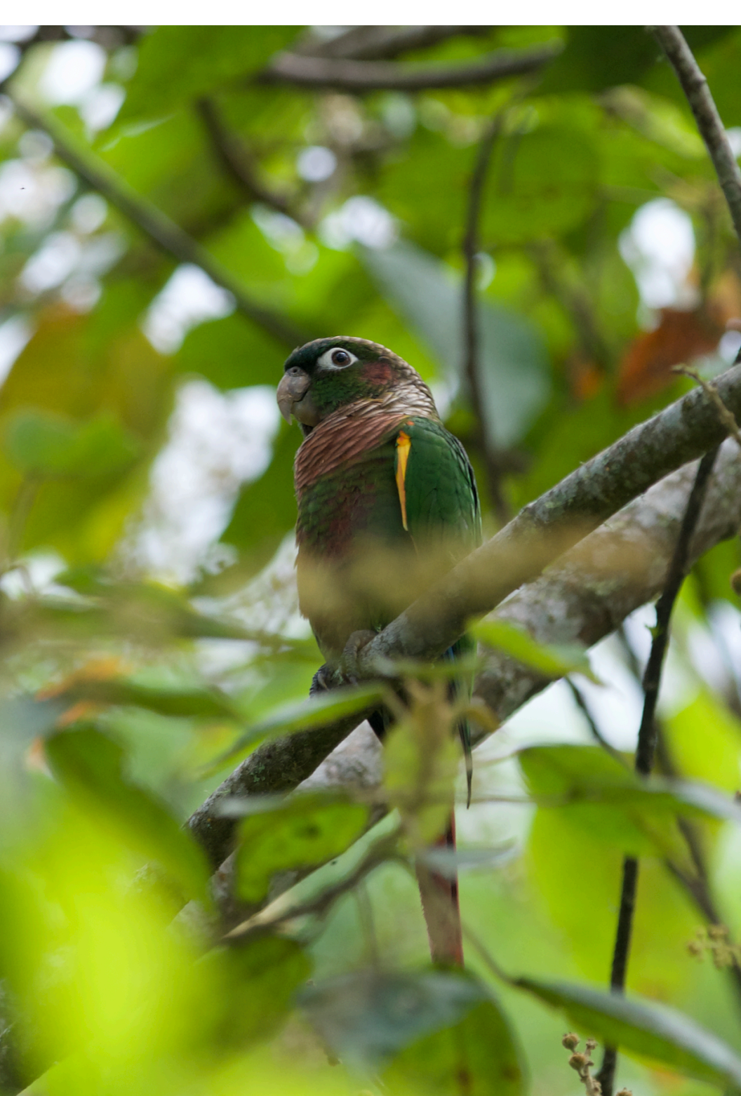
Pyrrhura calliptera | Brown-breasted Parakeet